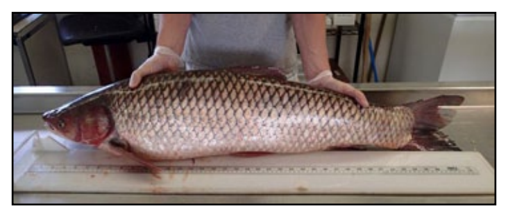
This 104 cm (41 inch) Grass Carp was caught in the Grand River near Dunnville, Ontario in April 2013 .Testing found that it was unable to reproduce.

The sea lamprey is an eel-like fish native to the Atlantic Ocean that was first reported in Lake Erie in 1921. The Great Lakes Fishery Commission, Fisheries and Oceans Canada (DFO), U.S. Fish and Wildlife Service (USFWS), and U.S. Army Corps of