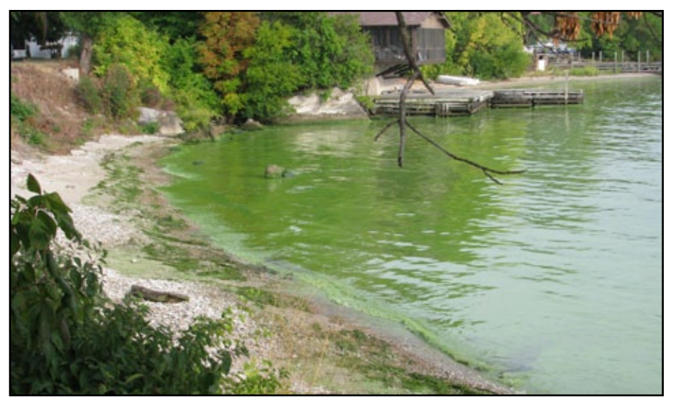
Harmful algal blooms, such as this one at Kelley's Island in Ohio, have become a regular summer occurrence in parts of Lake Erie. Addressing nutrients and harmful algal blooms is a priority of the Lake Erie LAMP and its partner agencies.

Continual improvements to lakewide management are being made. Current areas of focus are the lake ecosystem objectives, outreach and engagement plans, LAMPs, and management of nearshore waters. More information can be found at www.binational.net.